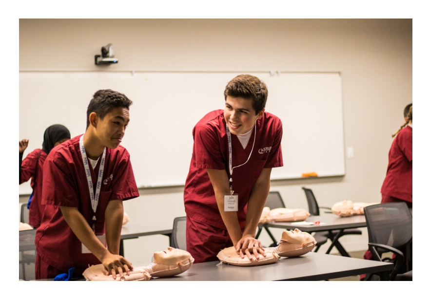
Augsburg Scrubs Camp participants

Through Scrubs Camp, the Partnership exposes more high school students to a vision of college and health care careers.